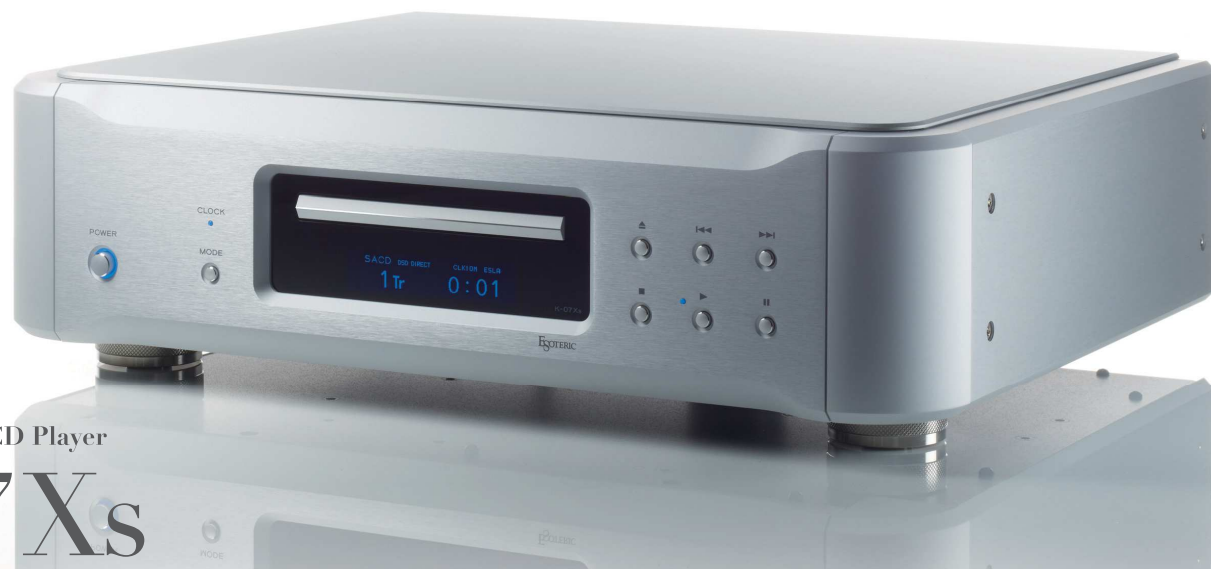
Super Audio CD/CD Player

The K-07Xs captures the essence of the Grandioso K1, with revolutionary innovations throughout the design. The Xs lets nothing get in the way of the music, providing an emotionally involving playback experience. A new chapter has been written in the history book of digital players.